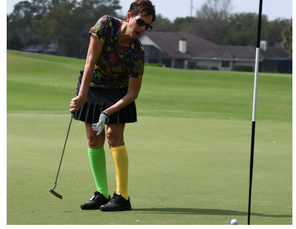
Please send us your pics so we can share the good, the bad, the funny and the ugly!